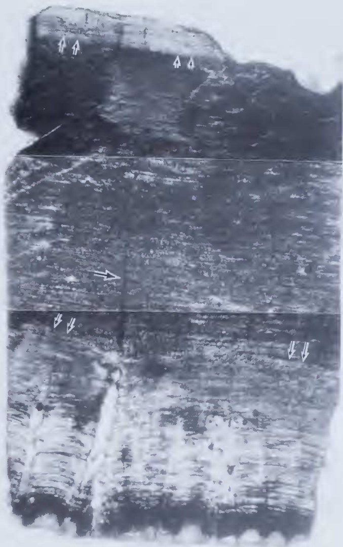
Figure 4 Thin section (radial) of the egg shell of the Cervantes egg showing the three major layers (exactly the same in Aepyornis ): arrows point to the boundary between the outer layer (top left only), the continuous layer (middle) and the mammillary layer. The dark vertical line indicated by the arrow is a faint indication of one of the pore canals (x50).

Aepyornis eggs comes from Betty Beach, near Manypeaks, Narrikup, Western Australia, where in 1980 a float was found that had originated in South Africa. The float had been released in 1977 as a part of a study of in-shore current movements. Thus, there is evidence supporting the transport of intact fragile material, such as eggs, over long oceanic distances.